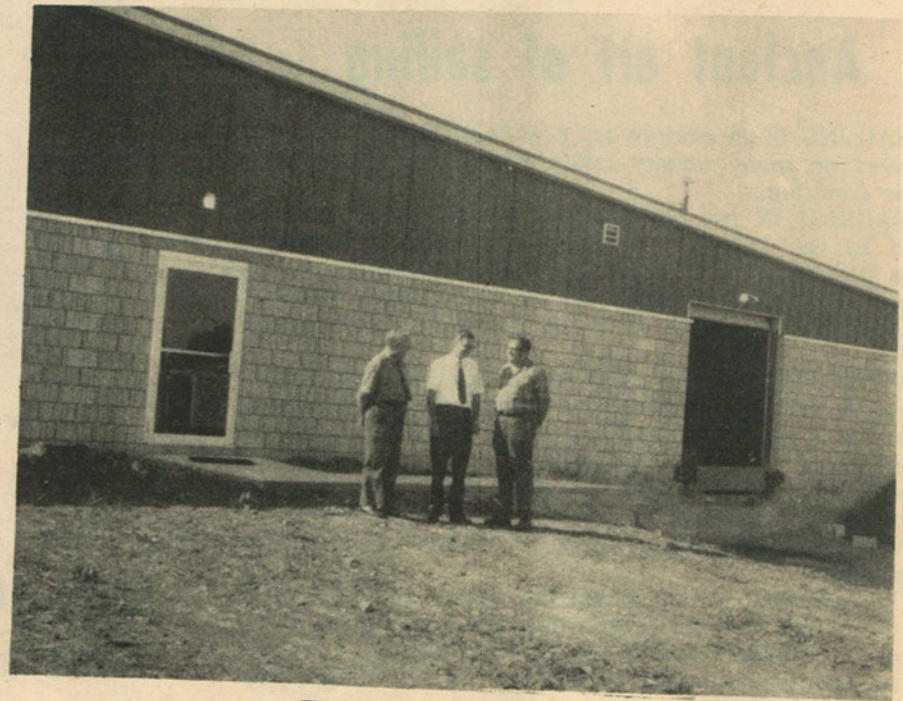
The men in front of the plant.

We are proud to have this opportunity of welcoming you to the community of Union Grove.